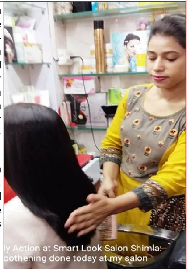
My Action at Smart Look Salon Shimla: Styling done today at my salon

She has started to repay her instalment against loan which she took from the bank for starting the parlour. She used a part of amount for buying the branded products. Now, her life has totally changed and she is making good profit out of her enterprise. She is also helping her parents financially.