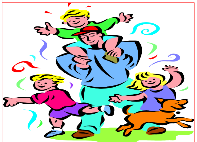
Picture depicts meaning of unity.

Unity is strength... when there is teamwork and collaboration, wonderful things can be achieved.