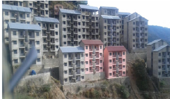
Houses under Ashiana - II, Dhalli, Shimla

Municipal Corporation Shimla under its flagship programme Basic Services for Urban Poor (BSUP) under JNNURM, in 1st Phase 05 families were allotted houses near Dhalli Tunnel, Shimla by Hon'ble Chief Minister, GoHP. The scheme envisages allocation of 94 houses to BPL families in Shimla city. The remaining 89 houses of IInd Phase can be given very soon.