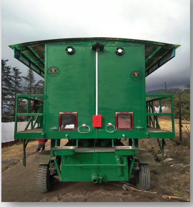
Mashobra (6 Seater)